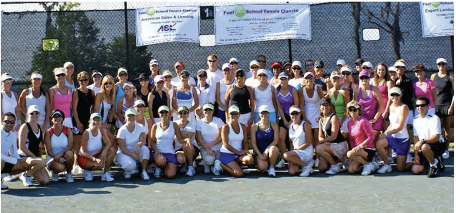
More than 100 players, spectators, supporters, and representatives from area public schools gathered for the first Annual FuelMySchool Tennis Classic at Isleworth