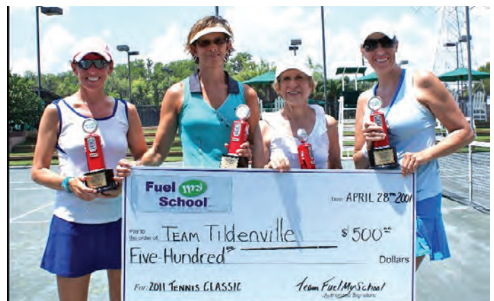
Team Tildenville triumphed in the inaugural 2011 FuelMySchool Tennis Classic at Isleworth