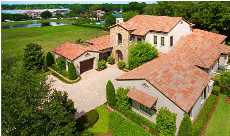
Windsong, Winter Park